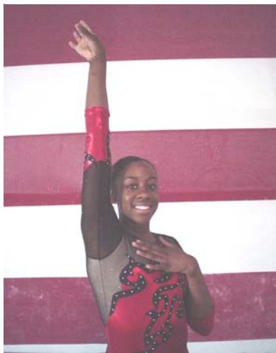
Gymnast - ranked #1 in the Nation (see story on Page 4)